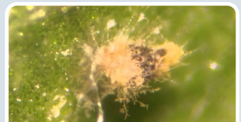
Beauveria bassiana , Paecilomyces sp.