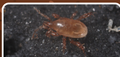
Hypoaspis (Gaeolaelaps) aculeifer